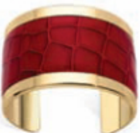
EMPRESS CUFF RED PATENT CROC 0878