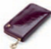
PURPLE PATENT 0441