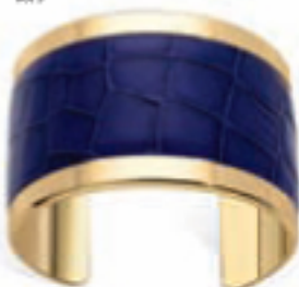
EMPRESS CUFF COBALT BLUE 0904 9979