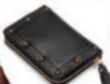
SMOOTH BLACK & BLACK 16826 0791