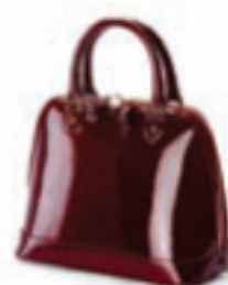
RED PATENT 0422