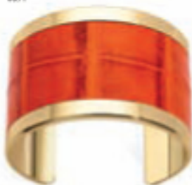
EMPRESS CUFF ORANGE CROC 0876