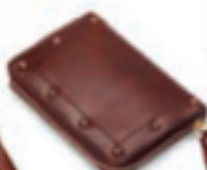
SMOOTH CHOCOLATE & STONE 16826 0796