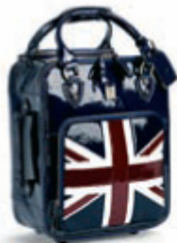
NAVY PATENT & UNION JACK 0542

The highly coveted Candy Case is the perfect roll-along case for that short getaway. Handmade in an array of colours, the Candy Case has a signature silk mix lining and matching luggage tag. The foldaway telescope handle is tucked away in a neat zipped compartment and the integral wheels are discreetly placed behind the bottom feet, which stand the case in all its glory.