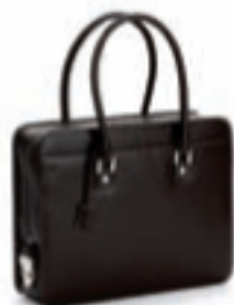
SMOOTH BLACK & BABY PINK VEGE 0020