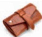
HERITAGE TAN CROC & BERGE SUEDE 0361