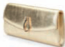
GOLD SNAKE 0485