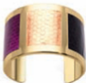
ROMA CUFF PURPLE, GOLD AND BLACK SNAKE 0818