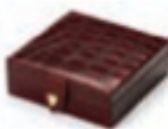
AMAZON BROWN CROC & STONE SUDEE 0962