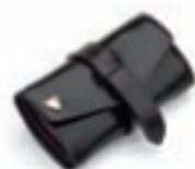
SMOOTH BLACK & PINK SUEDE 0620