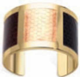
ROMA CUFF BROWN, GOLD AND BLACK SNAKE 0873