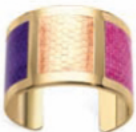
ROMA CUFF LAC, GOLD AND PINK SNAKE 0871