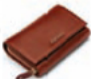
TAN PEBBLE 0804