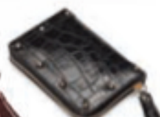
BLACK SOFT CROC & BLACK 16826 0795