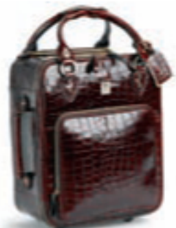
AMAZON BROWN CROC 0801