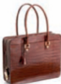
VINTAGE TAN CROC & CREAM VEGE 0150