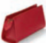
RED JEWEL CALF & BEIGE SUED 0201