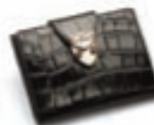
BLACK CROC 0769