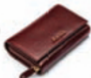
CHOCOLATE PEBBLE 0538