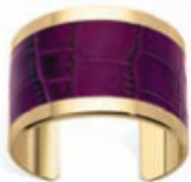
EMPRESS CUFF PURPLE CROC 0877