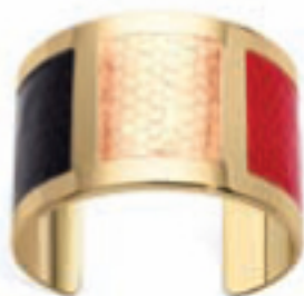
ROMA CUFF BLACK, GOLD AND RED SNAKE 0812