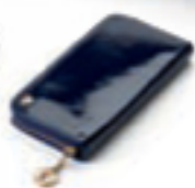
NAVY BLUE PATENT 0440