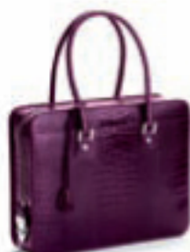
PURPLE CROC & CREAM VEGE 0080