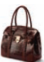
AMAZON BROWN SOFT CROC 0776