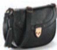
SMOOTH BLACK & BLACK 16826 0791