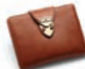
SMOOTH TAN 0808