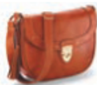
SMOOTH TAN & STONE 16826 0797