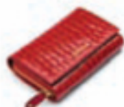
RED PATENT CROC 0501