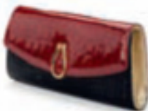
RED & BLACK CROC WITH GOLD SNAKE 0486