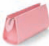
ASCOT PINK JEWEL CALF & CREAM SUED 0210