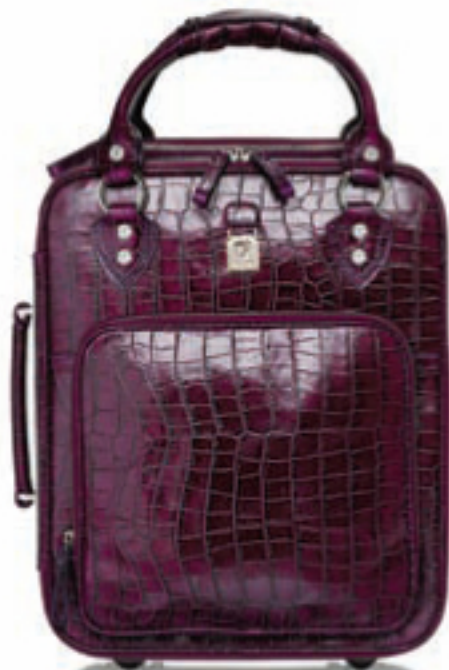
PURPLE CROC E587

The highly coveted Candy Case is the perfect roll-along case for that short getaway. Handmade in an array of colours, the Candy Case has a signature silk mix lining and matching luggage tag. The foldaway telescope handle is tucked away in a neat zipped compartment and the integral wheels are discreetly placed behind the bottom feet, which stand the case in all its glory.