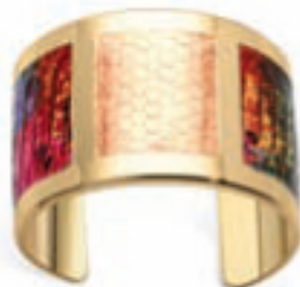
ROMA CUFF GOLD AND MULTI CROC 0875