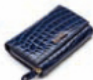
NAVY PATENT CROC 0499