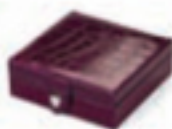
PURPLE CROC & CREAM SUDEE 0398