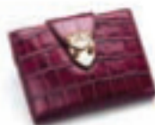
PURPLE CROC 0762