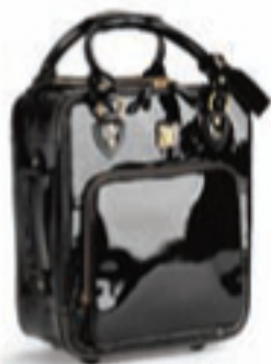
BLACK PATENT 0421

WE ARE UNABLE TO PERSONALISE THIS ITEM ALL TRAVEL BAGS ARRIVE IN AN ASPINAL PROTECTIVE LUGGAGE COVER