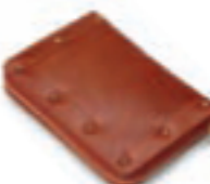
SMOOTH TAN & STONE 16826 0797