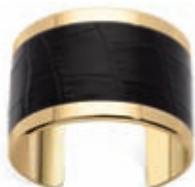
EMPRESS CUFF BLACK CROC 8974