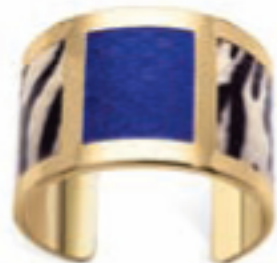
ROMA CUFF ZEBRA AND BLUE SNAKE 0876

Over sized statement jewellery is a key look this season. Make a dramatic style statement with our stunning range of Cuff Bracelets. The must-have jewellery accessory for the season ahead! Available in small and medium.