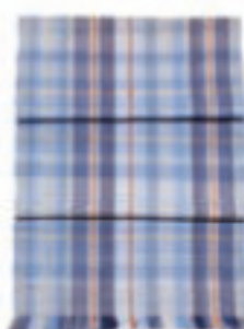
LIGHT BLUE 0907