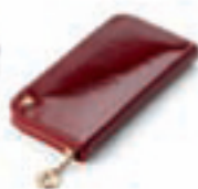
RED PATENT 0442