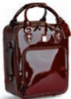
RED PATENT 0422