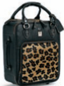
BROWN PEGGLE CALFSKIN & LEOPARD PRINT INIDE E694