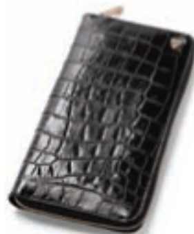
BLACK CROC & RED SUED 0017

THIS ITEM CAN BE PERSONALISED WITH UP TO 4 INITIALS (PASSPORT COVER ONLY)