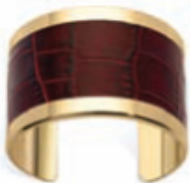
EMPRESS CUFF AMAZON CROC 0873