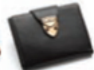
SMOOTH BLACK 0768