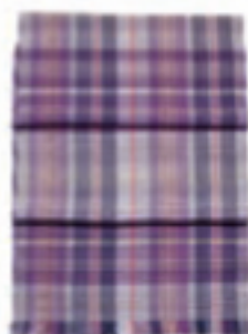
PURPLE AND WHITE 0908