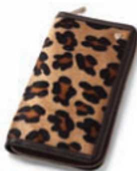
BROWN GALPIKEN & LEOPARD PRINT WIDE 0763