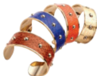
PLEASE SEE PAGE 7 FOR DETAILS OF THE ATHENA CUFF BRACELET