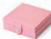
ASCOT PINK JEWEL CALF & CREAM SUDEE 0818