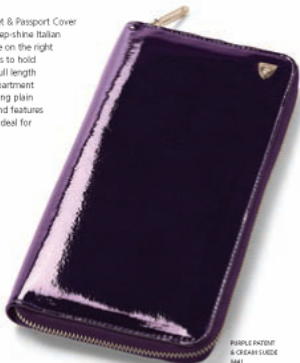
PURPLE PATENT & CREAM SUED 0441

ZIPPED TRAVEL WALLET & PASSPORT COVER ITEM CODE: 062-0827