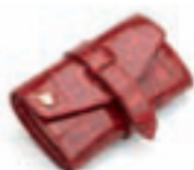
RED PATENT CROC & CREAM SUEDE 0305