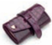
PURPLE CROC & CREAM SUEDE 0306