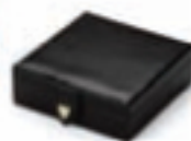
SMOOTH BLACK & CREAM SUDEE 0368