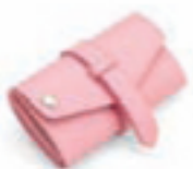
ASCOT PINK JEWEL CALF & CREAM SUEDE 0618