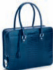
NAVY BLUE CROC & CREAM VEGE 0426