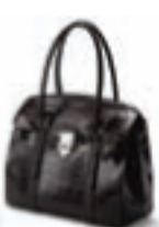
BLACK SOFT CROC 0777