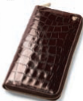
AMAZON CROC BROWN & STONE SUED 0802