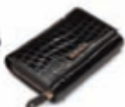
BLACK PATENT CROC 0495