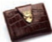
AMAZON BROWN CROC 0767