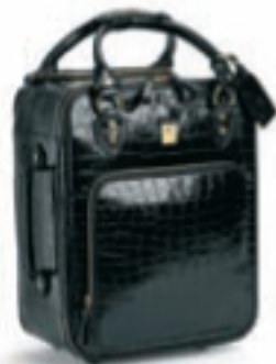
BLACK CROC 0615