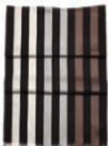
GREY AND BLACK 0909