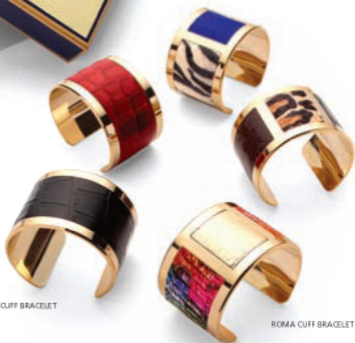
EMPRESS CUFF BRACELET

VIEW THE FULL COLLECTION ASPINAL LEATHER CUFF BRACELETS ONLINE