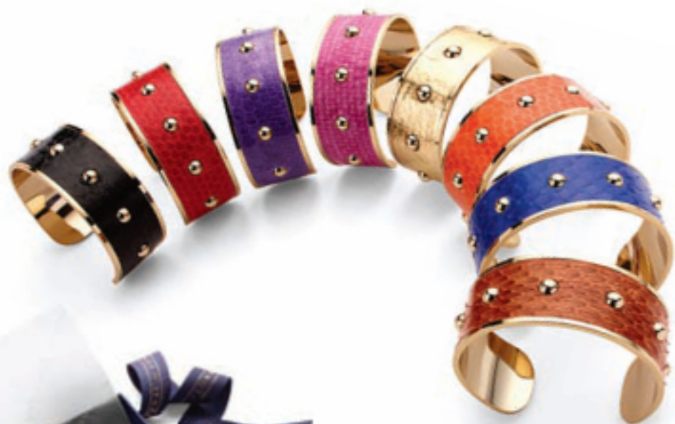
ATHENA CUFF BRACELET