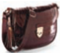
AMAZON BROWN CROC & STONE 16826 0794