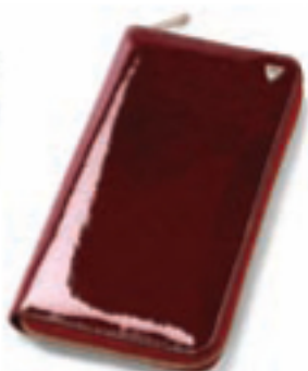
RED PATENT & CREAM SUED 0442

THIS ITEM CAN BE PERSONALISED WITH UP TO 4 INITIALS (PASSPORT COVER ONLY)