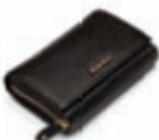
BLACK PEBBLE 0529