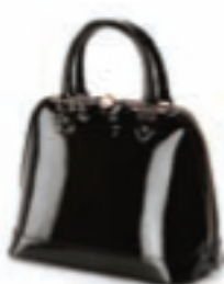
BLACK PATENT 0421