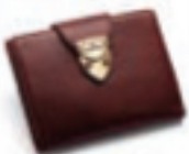
SMOOTH CHOCOLATE 0802