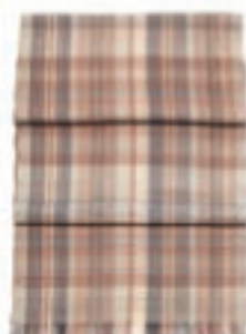
BEIGE AND GREY 0906

TARTAN 100% EXTRA FINE MERINO WOOL ITEM CODE: 051-1009