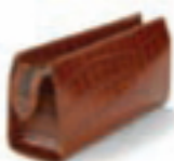
VINTAGE TAN CROC & BEIGE SUED 0203