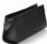
BLACK JEWEL CALF & RED SUED 0205