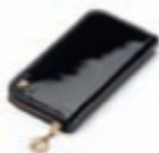
BLACK PATENT 0429