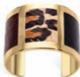
ROMA CUFF BROWN LEOPARD AND BLACK 0877