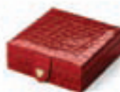
RED PATENT CROC & CREAM SUDEE 0637