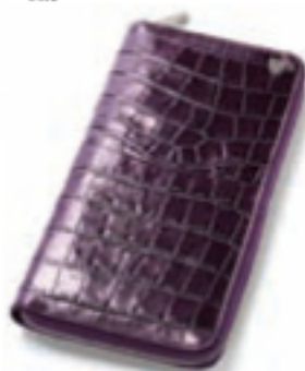
PURPLE CROC & CREAM SUED 0388