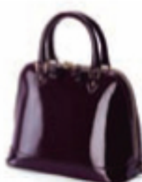
PURPLE PATENT 0421