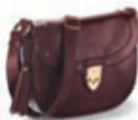
SMOOTH CHOCOLATE & STONE 16826 0796