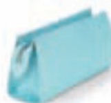
AQUA JEWEL CALF & LIME SUED 0202