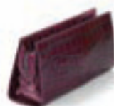
PURPLE CROC & CREAM SUED 0208

WE ARE UNABLE TO PERSONALISE THESE ITEMS