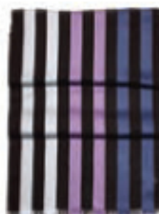
PURPLE AND BLACK 0911

ALL SCARVES ARRIVE GIFT WRAPPED IN ASPINAL EXQUISITE SIGNATURE PRESENTATION