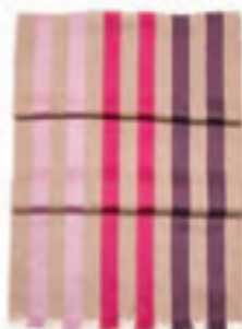
PINK AND PURPLE 0913

WIDE STRIPE SILK, WOOL AND LINEN MIX ITEM CODE: 051-1010