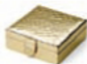
METALLIC GOLD & CREAM 0638