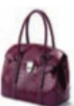
PURPLE SOFT CROC 0768