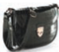
BLACK SOFT CROC & BLACK 16826 0795