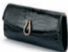
BLACK PATENT CROC 0482