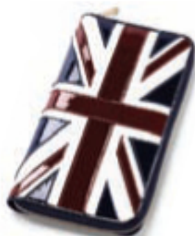
THE BRIT 0642

THE BRIT TRAVEL WALLET & PASSPORT COVER ITEM CODE: 062-0884