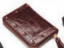
AMAZON BROWN SOFT CROC & STONE 16826 0794