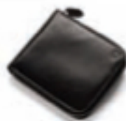
SMOOTH BLACK 0019