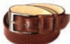
AMAZON BROWN CROC 0001