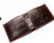
COGNAC WITH BROWN SNAKE 0486