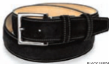
BLACK SUEDE 0713