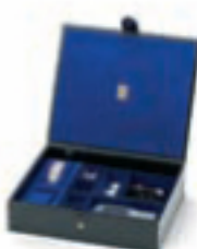
BLACK CROC & COBALT SUEDE 0076