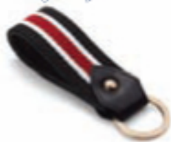
BLACK, WHITE AND RED 0035