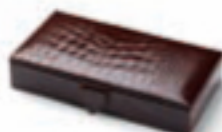
AMAZON BROWN CROC & STONE SUIDE 0002