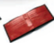
BLACK WITH RED SNAKE 0485