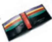
BLACK WITH RAINBOW SNAKE 0483