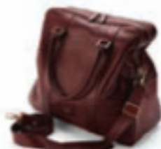
Dark Brown 0003