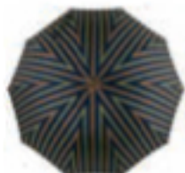
REGIMENTAL STRIPE 0001