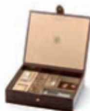
AMAZON BROWN & STONE SUEDE 0062