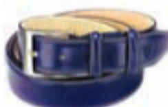
SMOOTH SAPPHIRE BLUE SADDLE STITCH 0130