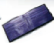
BLACK WITH VIOLET SNAKE 0484