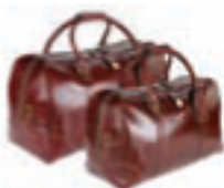
SMOOTH COGNAC 0048