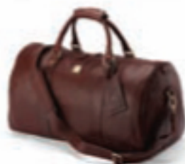
Dark Brown 0003