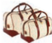
BEIGE CANVAS 0015

WE ARE UNABLE TO PERSONALISE THIS ITEM ALL TRAVEL BAGS ARRIVE IN AN ASPINAL PROTECTIVE LUGGAGE COVER