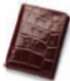
AMAZON BROWN CROC 0001