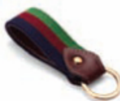
NAVY BLUE AND GREEN 0037