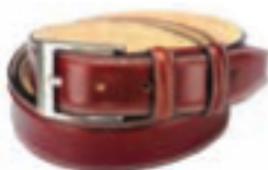
SMOOTH COGNAC SADDLE STITCH 0131

SIZES SMALL 31.5" TO 35.5" MEDIUM 35.5" TO 39.5" LARGE 39.5" TO 43"