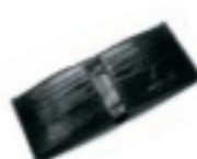
BLACK WITH BLACK SNAKE 0481