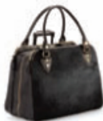
BLACK CALF & BLACK HIDE 0443

WE ARE UNABLE TO PERSONALISE THIS ITEM ALL TRAVEL BAGS ARRIVE IN AN ASPINAL PROTECTIVE LUGGAGE COVER