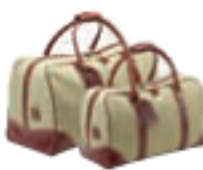
KHAKI CANVAS 0905