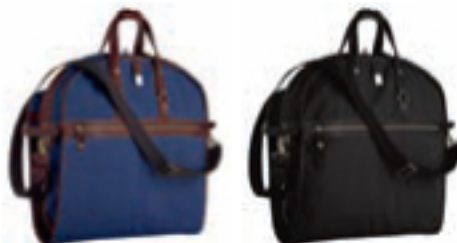
NAVY CANVAS 8371