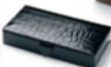
BLACK CROC & COBALT BLUE SUIDE 0018