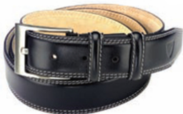
SMOOTH BLACK SADDLE STITCH 0029