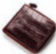
AMAZON BROWN CROC 0001