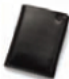
SMOOTH BLACK 0019