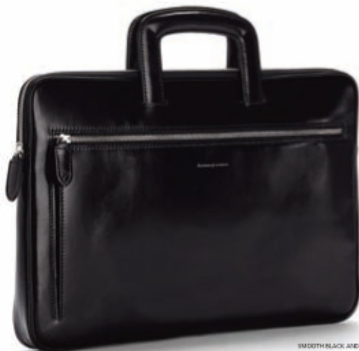
SMOOTH BLACK AND COBALT BLUE 0921

Combining functionality and versatility with elegant Aspinall style, the Connaught Document Case is the perfect business accessory for busy executives looking for a slim-line alternative to a bulky briefcase. Handmade from the finest mock croc or smooth calf leather and lined in signature super-soft suede, this leather document case features retractable dual handles allowing it to be tucked under the arm or extend the handles to carry as a briefcase.