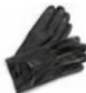
BLACK NAPPA 0167