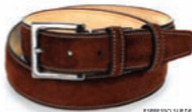
ESPRESSO SUEDE 0718