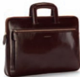
SMOOTH COGNAC AND STONE SUEDE 0344