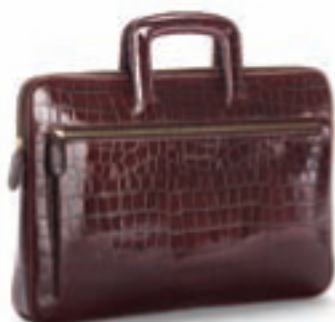
AMAZON BROWN CROC AND STONE SUEDE 0662