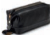
SMOOTH BLACK 0019