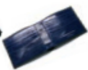
BLACK WITH BLUE SNAKE 0482