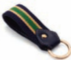
NAVY BLUE AND GREEN 0036