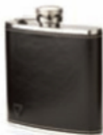
SMOOTH BLACK 0001