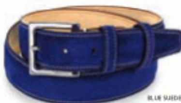
BLUE SUEDE 0719