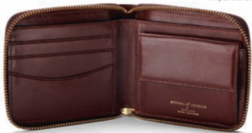
ZIPPED BILLFOLD COIN WALLET ITEM CODE: 039-1032

Handmade in mock croc or smooth calf leather, our classically stylish Zipped Billfold Coin Wallet features monogrammed silk lining and is secured with a fine quality Swiss made zip with leather tab zip pull. A stylish and functional men's leather zipped wallet.