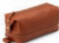
SMOOTH TAN 0046