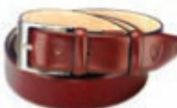
SMOOTH COGNAC 0045