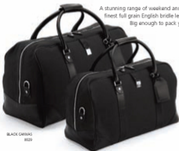
BLACK CANVAS 0029

Purchase the Travel Bag Set and save up to £195.00