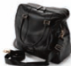
Black Deer 0529