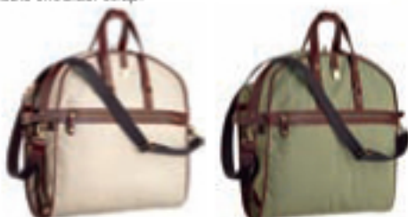
BEIGE CANVAS 0813