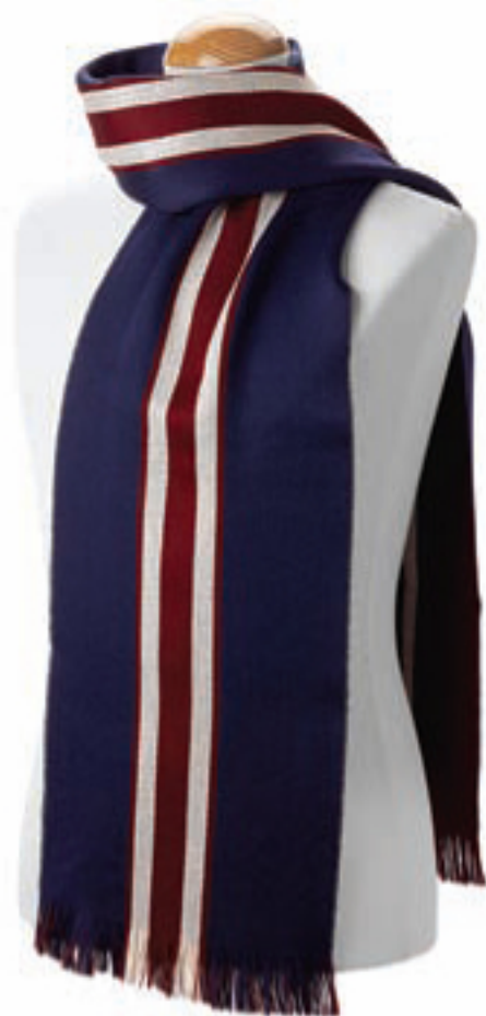
CENTRAL STRIPE 59% MERINO WOOL AND 41% WOOL ITEM CODE: 051-1006

Choose from an exquisite selection of masculine styles and hues to suit the most discerning of gents. All our scarves are made in Scotland with the finest 100% cashmere and extra fine Merino wool and made to a superior thickness and quality for a durable, comfortable statement of style and sophistication.