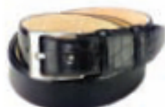
BLACK CROC 0055