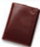
SMOOTH COGNAC 0046