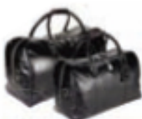
SMOOTH BLACK 0027