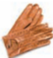
TAN NAPPA 0212