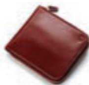
SMOOTH COGNAC 0046