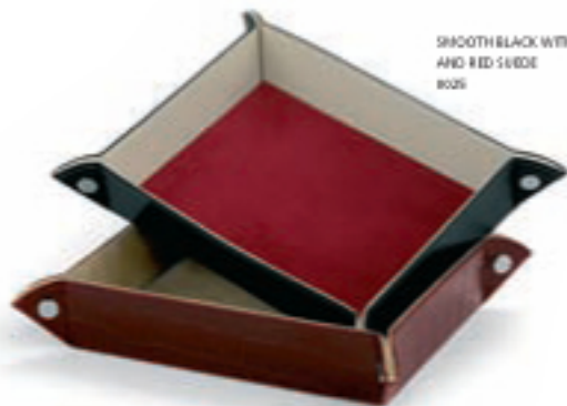
SMOOTH BLACK WITH NORY AND RED SUEDE 8026