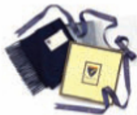
ALL SCARVES ARRIVE GIFT WRAPPED IN A SPINAL EXQUISITE SIGNATURE PRESENTATION