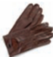
BROWN NAPPA 0157