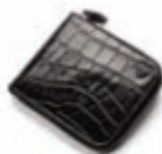
BLACK CROC 0075