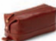
SMOOTH COGNAC 0045