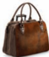
BROWN CALF & BROWN HIDE 0444