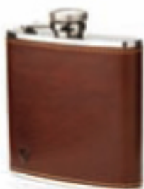
SMOOTH COGNAC 0086