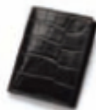
BLACK CROC 0015