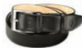
SMOOTH BLACK 0019

ALL BELTS ARRIVE GIFT WRAPPED IN A SERIAL EXQUISITE SIGNATURE PRESENTATION