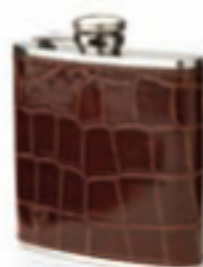
AMAZON CROC BROWN 0002