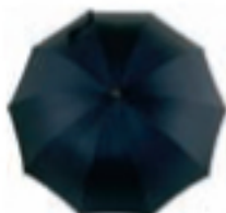
FURRY PRINSTRIPES 0028