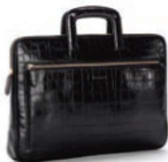
BLACK CROC AND STONE SUEDE 0669