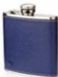
NAVY PEBBLE CALF 0026