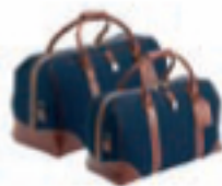
NAVY CANVAS 8371