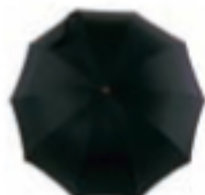
CITY POLKA DOT 0020