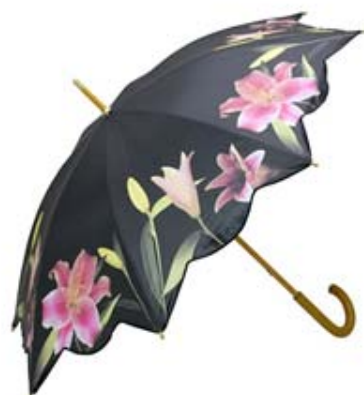
Motiv umbrella "Lilies"