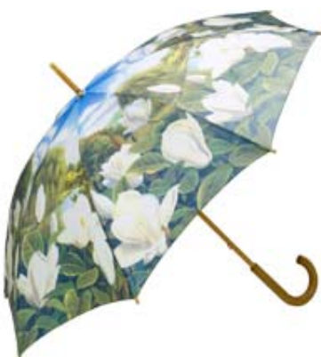
Motiv umbrella "Magnolias"