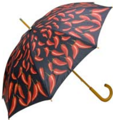
Motiv umbrella "Chili pepper"