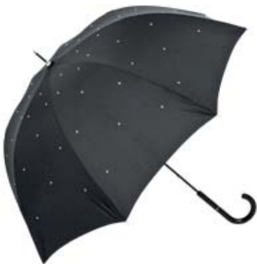
Swarovski umbrella "Lea" black