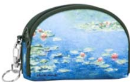
Minibag Claude Monet: "Waterlilies"