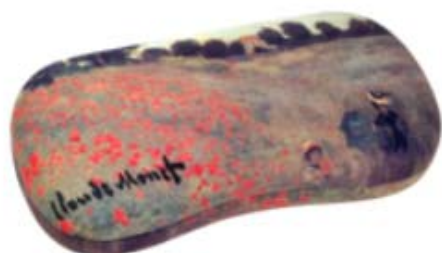
Eyeglass case Claude Monet: "Field of poppies"