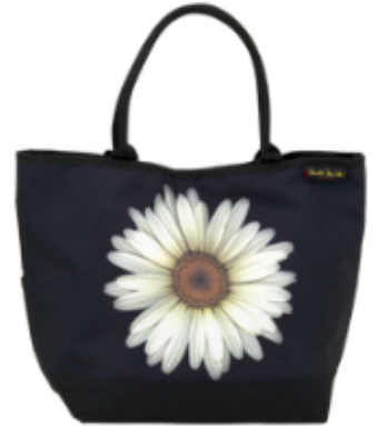
Tote bag Harold Feinstein: "Marguerite"