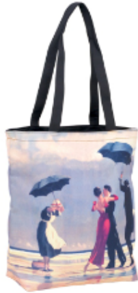
Tote bag Jack Vettriano: "Singing Butler"