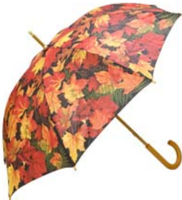
Motiv umbrella "Autumn leaves"