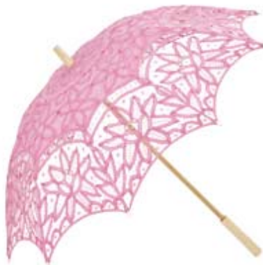
Lace umbrella "Vivienne" pink