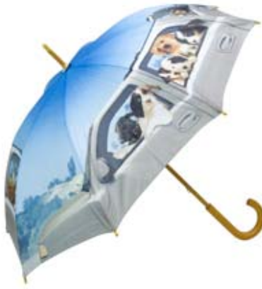
Motiv umbrella "Dogs on Tour"