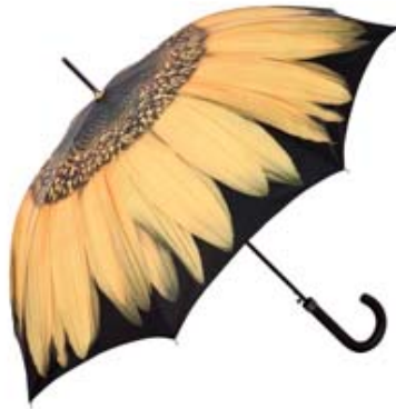
Automatic umbrella Harold Feinstein: "Sunflower"