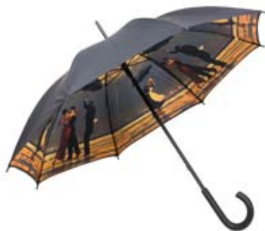
Double layer Jack Vettriano: "Singing Butler"