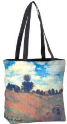
Tote bag Claude Monet: "Field of poppies"