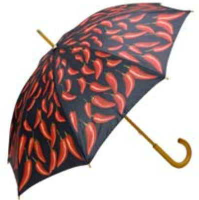
Motiv umbrella "Chili pepper"