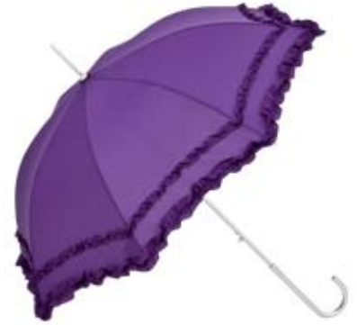
Automatic umbrella "Mary" purple