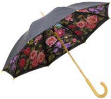
Double Layer "Rose garden"