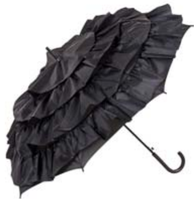
Automatikschild "Daphne" schwarz sold out