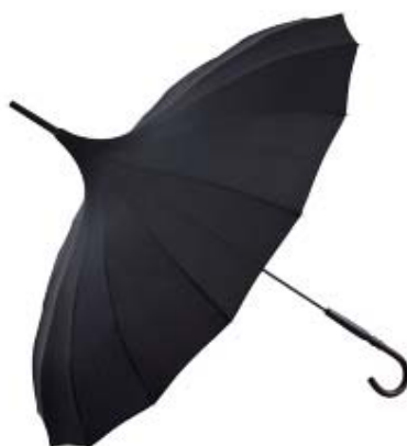
Pagoda "Cécile" black