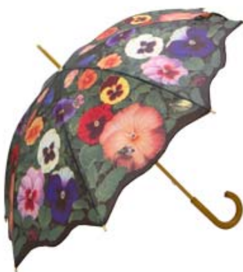
Motiv umbrella "Pansies"