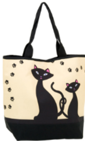
Tote bag "Black cats"