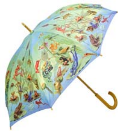
Motiv umbrella "Frog family I"