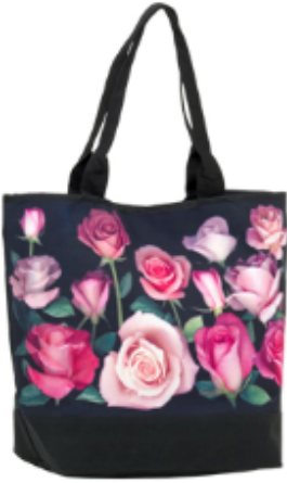
Tote bag "Bouquet of roses"