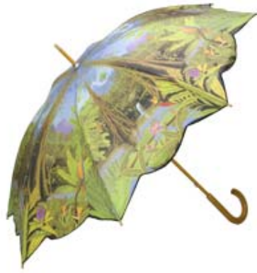
Motiv umbrella "Rain forest"