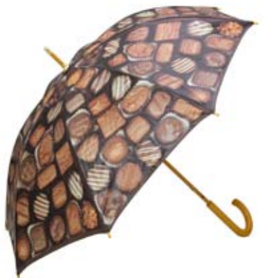
Motiv umbrella "Choco"