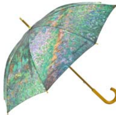
Motiv umbrella Claude Monet "The garden"