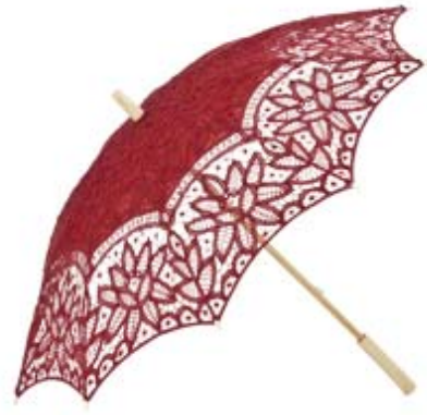
Lace umbrella "Vivienne" wine red