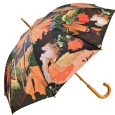
Motiv umbrella Paul Gauguin "Tahiti"