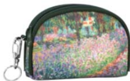
Minibag Claude Monet: "The garden"