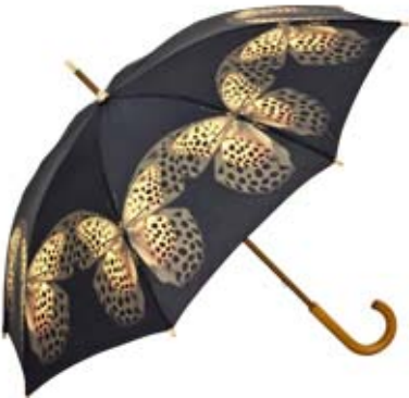
Motiv umbrella "Butterfly"