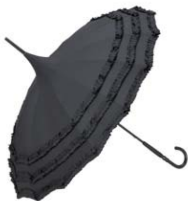
Pagoda "Amelie" black