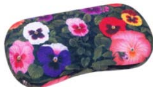
Eyeglass cases "Pansies"