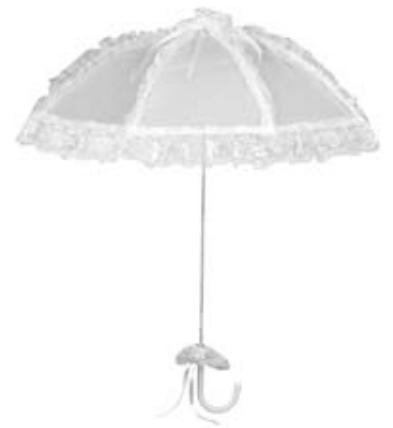
Brautschirm "Malisa" weiß