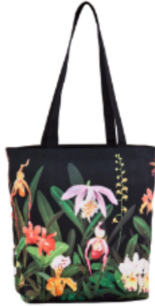
Tote bag "Orchids"