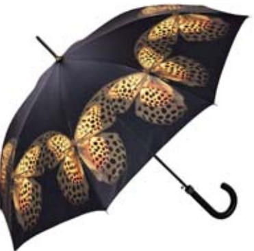
Automatic umbrella "Butterfly"