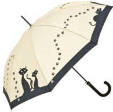
Automatic umbrella "Black cats"