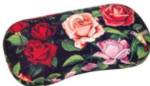
Eyeglass case: "Rose garden"