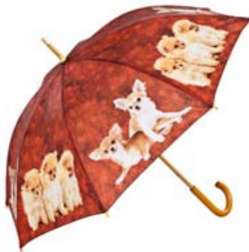
Motiv umbrella "Spitz und Chihuahua"