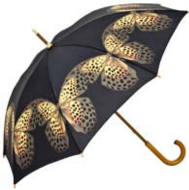
Motiv umbrella "Butterfly"