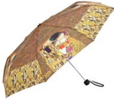
Folding umbrella Gustav Klimt: "The kiss"