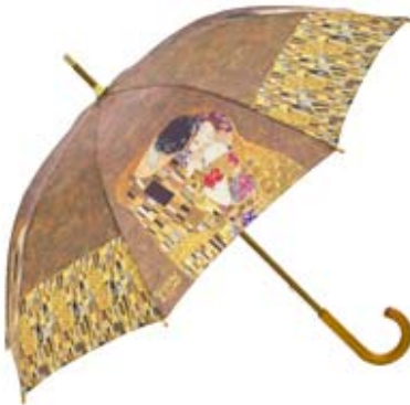
Motiv umbrella Gustav Klimt: "The kiss"