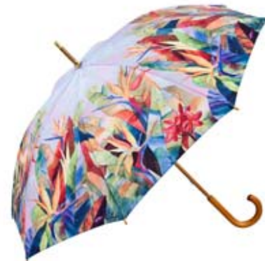
Motiv umbrella "Bird of paradise" coloured