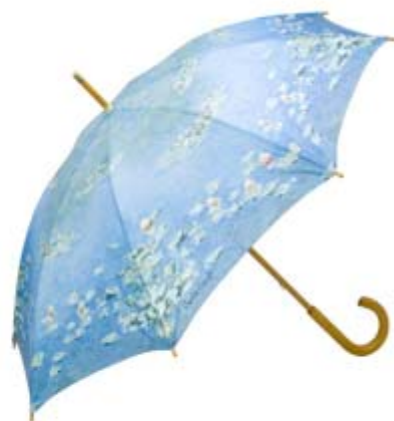
Motiv umbrella Claude Monet: