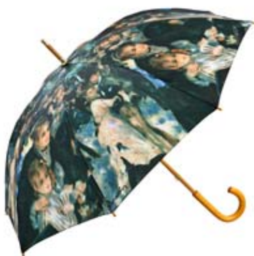
Motiv umbrella Pierre-Auguste Renoir "Le Moulin de la Galette"