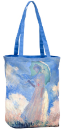
Tote bag Claude Monet: "Women with umbrella"