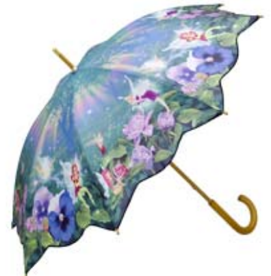
Motiv umbrella "Faries"