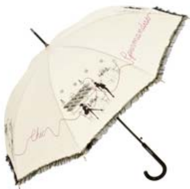
Chantal Thomass Design-Schirm "Arielle" creme