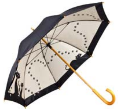
Double Layer "Black cats"