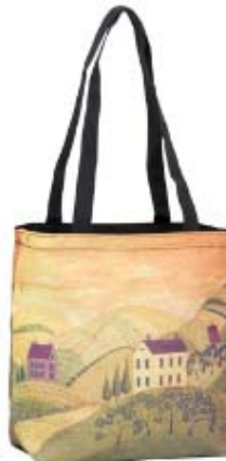
Tote bag "Farmland"