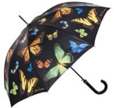
Automatic umbrella Harold Feinstein "Butterfly round dance"