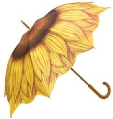
Motiv umbrella "Sunflower"