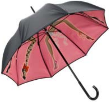
Chantal Thomass Design-Schirm "Satine"