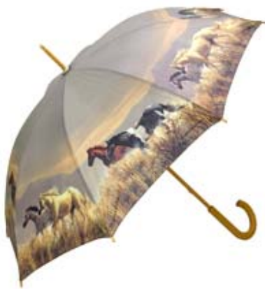
Motiv umbrella "Wild horses at the Camargue"