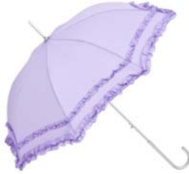
Automatic umbrella "Mary" lilac