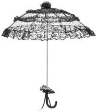
Brautschirm "Salomea" schwarz