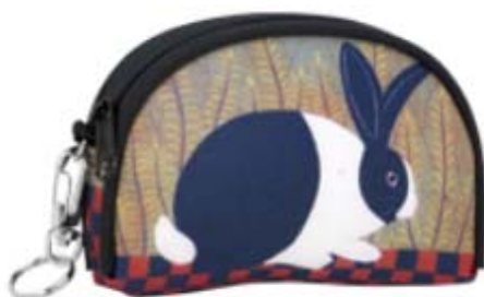
Minibag "Checkerboard Bunny"