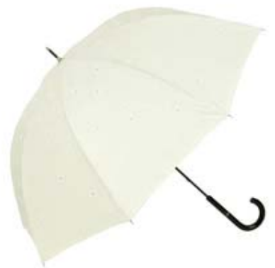
Swarovski umbrella "Lea" creme sold out