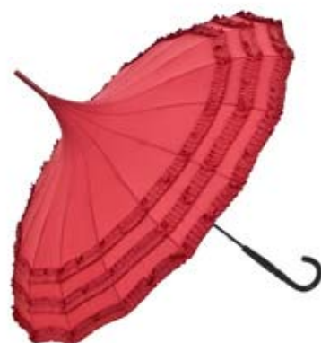
Pagoda "Amelie" red