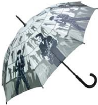
Automatic umbrella "Jailhouse Rock"