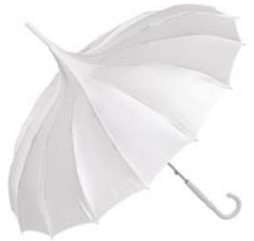
Pagoda "Cécile" Satin, white