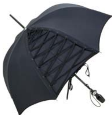
Jean Paul Gaultier Design-Schirm "Semja"