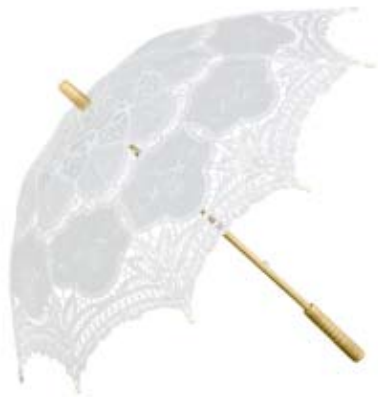
Lace umbrella "Julie" white