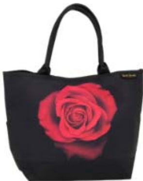
Tote bag Harold Feinstein: "Rose"