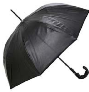
Jean Paul Gaultier Design-Schirm "Sirius"