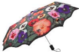
Folding umbrella "Pansies" sold out