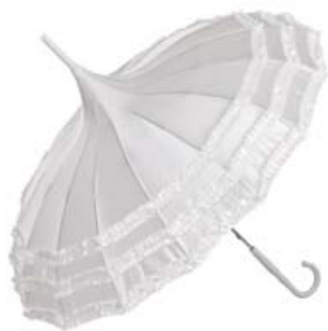
Pagoda "Amelie" Satin white