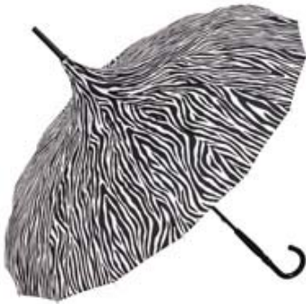
Pagoda "Cécile" Zebra