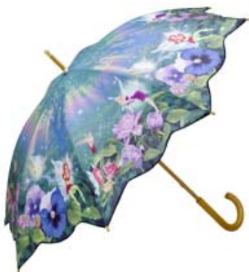
Motiv umbrella "Faries"