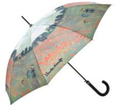
Automatic umbrella Claude Monet "Field of poppies"