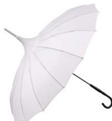
Pagoda "Cécile" ecru