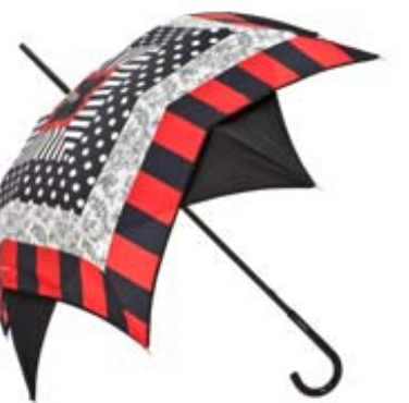
Chantal Thomass Design-Schirm "Isabel"