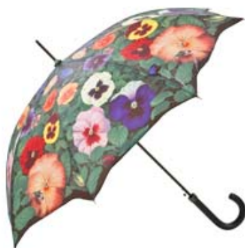
Automatic umbrella "Pansies"