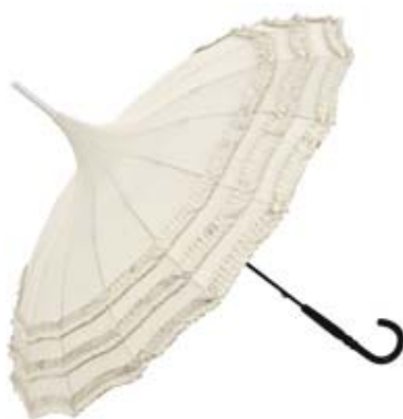
Pagoda "Amelie" ecru