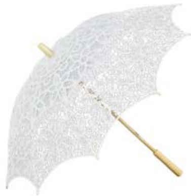
Lace umbrella "Vivienne" white