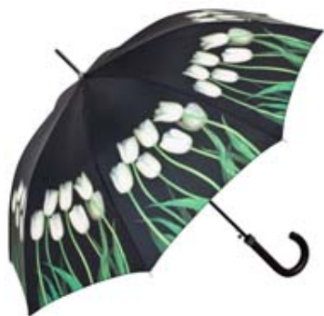
Automatic umbrella Harold Feinstein "White tulips"