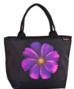
Tote bag Harold Feinstein: "Cosmo"