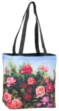
Tote bag "Rose garden"