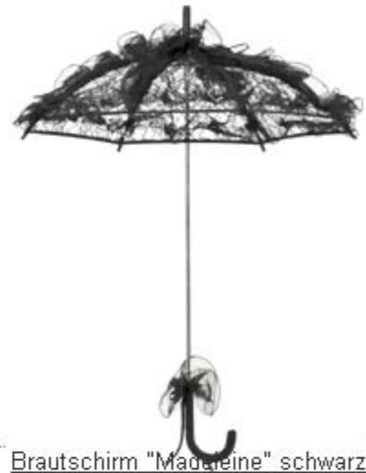
Brautschirm "Madeline" schwarz