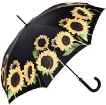
Automatic umbrella "Field of sunflowers"