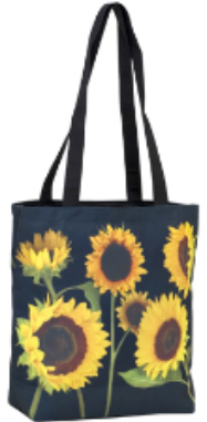
Tote bag "Field of sunflowers"