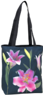
Tote bag "Lilies"