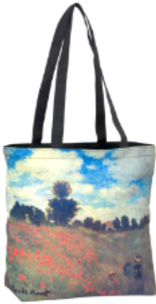
Tote bag Claude Monet: "Field of poppies"