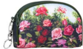
Minibag "Rose garden"