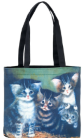
Small tote bag "Kittens"