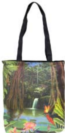
Tote bag "Rain forest"