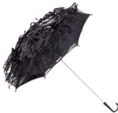
Brautschirm "Callista" schwarz