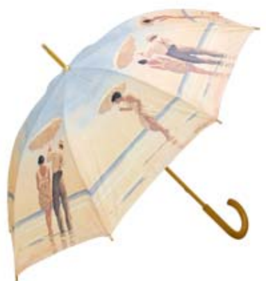
Motive umbrella Jack Vettriano: "On the beach"