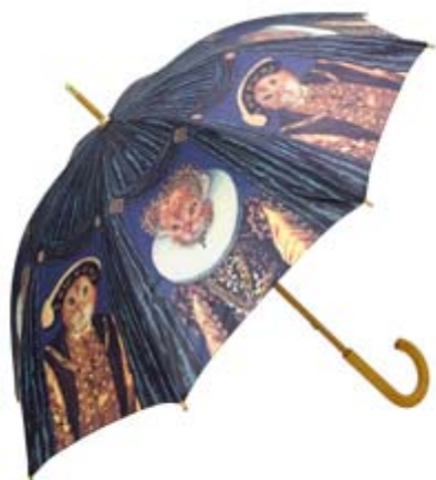
Motiv umbrella "Royal Cats"