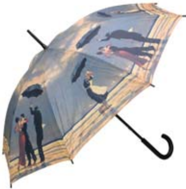
Automatic umbrella Jack Vettriano "Singing Butler"