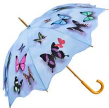
Motiv umbrellas "Butterflies" blue