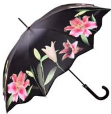
Automatic umbrella "Lilies" sold out