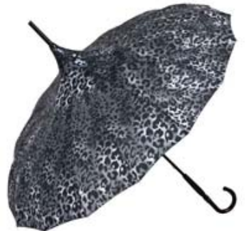
Pagoda "Cécile" Anaconda