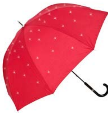
Swarovski umbrella "Lea" red