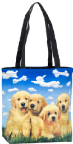
Tote bag "Puppies and clouds"