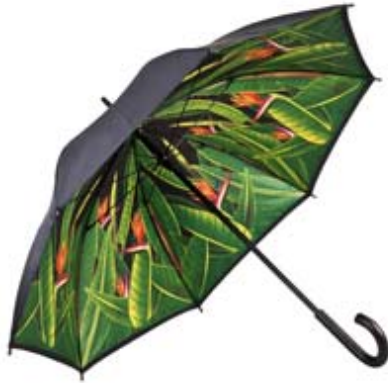
Double Layer "Bird of paradise" green/black