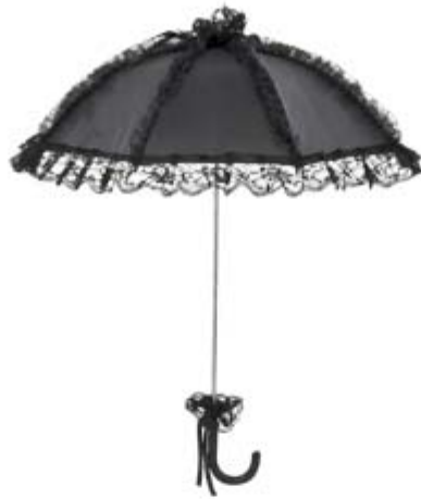
Brautschirm "Malisa" schwarz