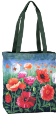
Tote bag "Poppies"