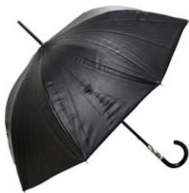
Jean Paul Gaultier Design-Schirm "Verio"