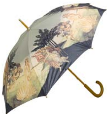
Motiv umbrella Sandro Botticelli: "Birth of Venus"