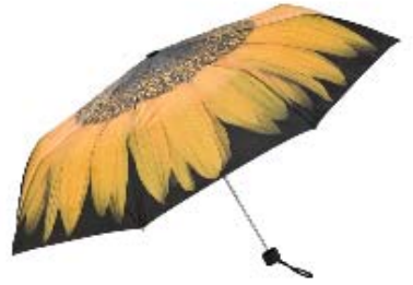
Folding umbrella Harold Feinstein: "Sunflower"