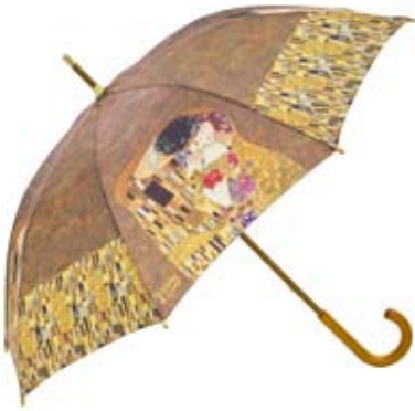
Motiv umbrella Gustav Klimt: "The kiss"