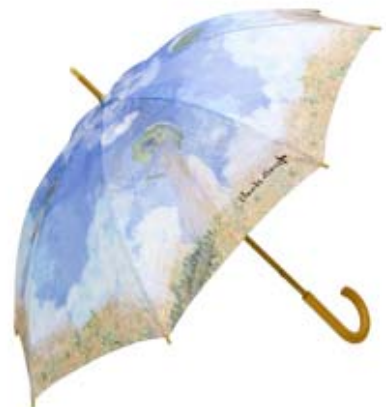
Motiv umbrella Claude Monet: "Women with umbrella"