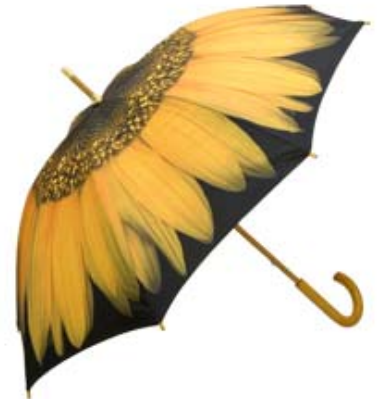
Motiv umbrella Harold Feinstein: "Sunflower"