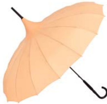
Pagoda "Cécile" apricot