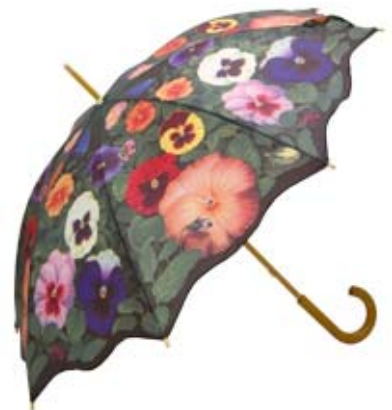
Motiv umbrella "Pansies"