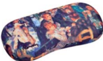
Eyeglass case Pierre-Auguste Renoir: "Le Moulin de la Galette"