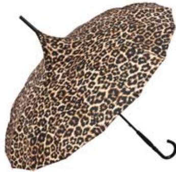
Pagoda "Cécile" Leopard