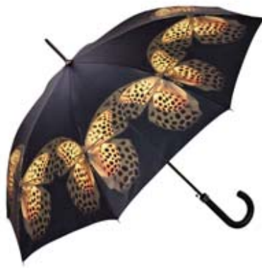
Automatic umbrella "Butterfly"