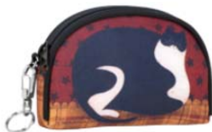
Minibag "Fat cat"