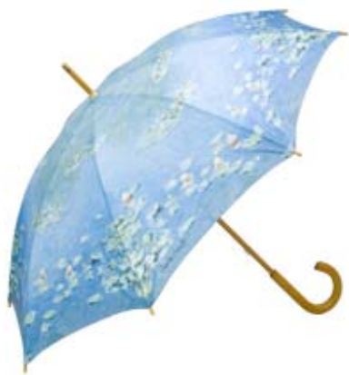
Motiv umbrella Claude Monet: "Waterlilies" sold out