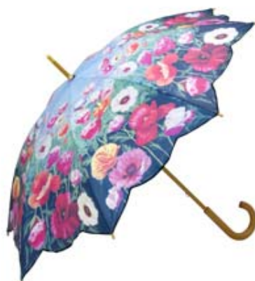
Motiv umbrella "Poppies"