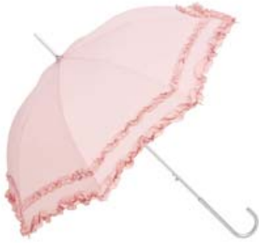
Automatic umbrella "Mary" pink