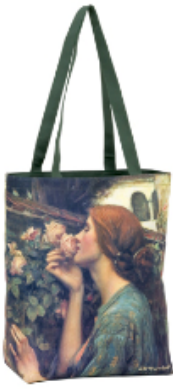
Tote bag John W. Waterhouse: "My sweet rose"