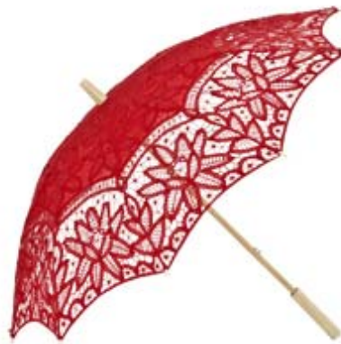
Lace umbrella "Vivienne" red