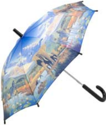
Children umbrella "Africa"