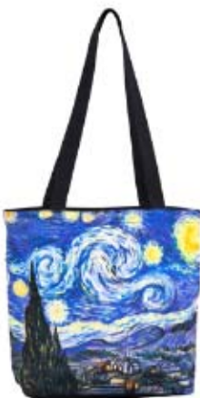
Tote bag Vincent van Gogh: "The starry night"