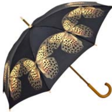
Motiv umbrella "Butterfly"