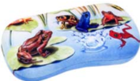
Eyeglass case "Frog family"