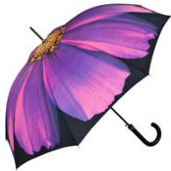
Automatic umbrella Harold Feinstein: "Cosmo"