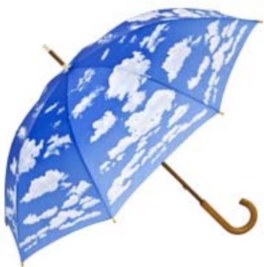
Motiv umbrella "Summer sky"