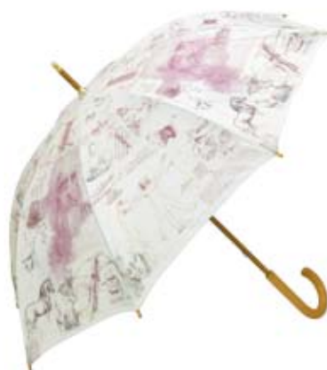
Motiv umbrella "Leonardo da Vinci"