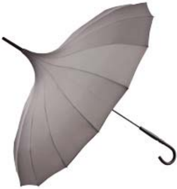
Pagoda "Cécile" grey