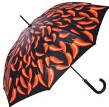
Automatic umbrella "Chili pepper"