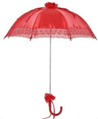
Brautschirm "Nathalie" rot