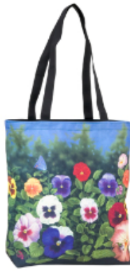
Tote bag "Pansies"