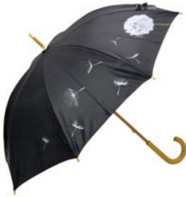
Motiv umbrella "Dandelion"