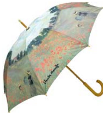
Motiv umbrella Claude Monet "Field of poppies"