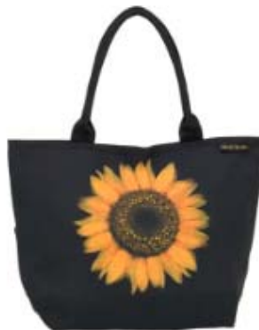
Tote bag Harold Feinstein: "Sunflower"