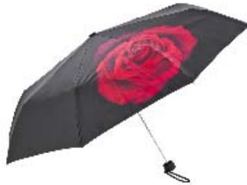
Folding umbrella Harold Feinstein: "Rose"