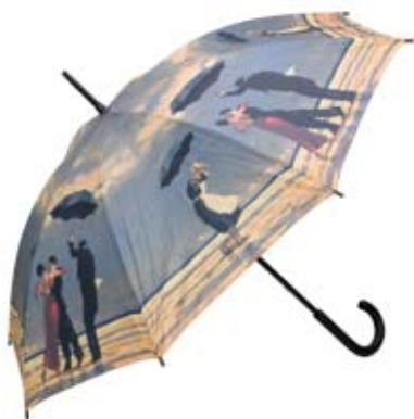
Automatic umbrella Jack Vettriano "Singing Butler"