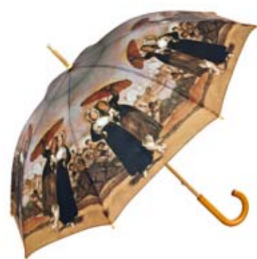
Motiv umbrella Francisco de Goya: "The letter"