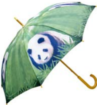
Motiv umbrella "Panda"