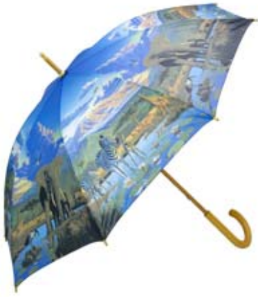
Motiv umbrella Africa