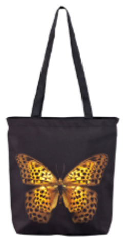
Tote bag "Butterfly"