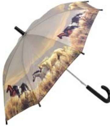
Children umbrella "Wild horses at the Camargue"