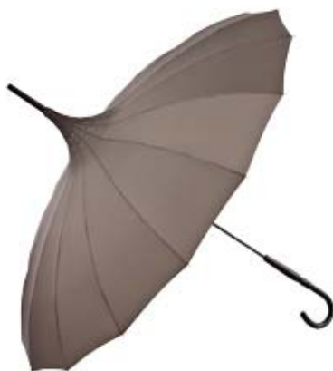
Pagoda "Cécile" brown