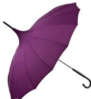
Pagoda "Cécile" purple