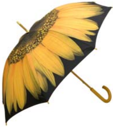
Motiv umbrella Harold Feinstein: "Sunflower"