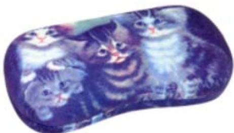
Eyeglass case "Kittens"