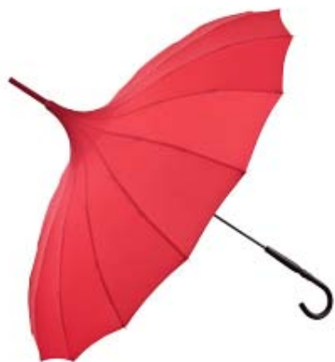
Pagoda "Cécile" red