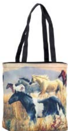
Tote bag "Wild horses at the Camargue"