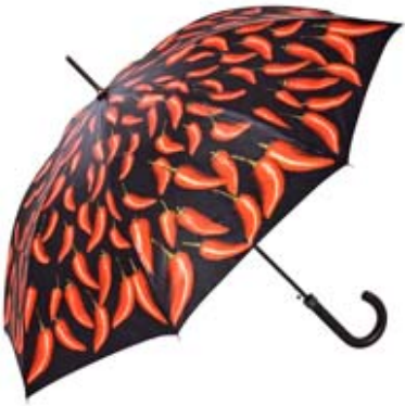
Automatic umbrella "Chili pepper"