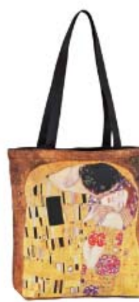
Tote bag Gustav Klimt: "The kiss"