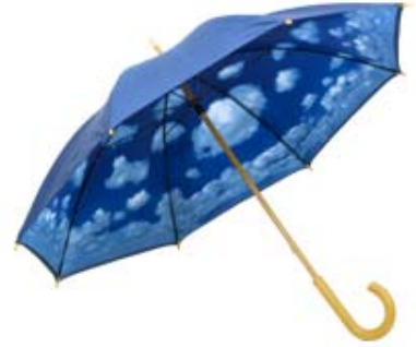
Double layer "Summer sky"