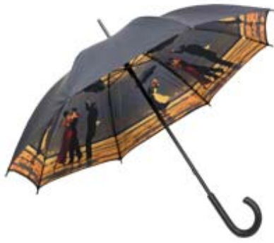
Double layer Jack Vettriano: "Singing Butler"