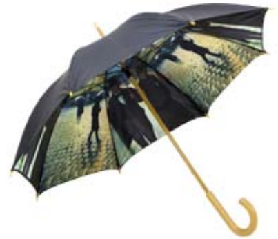
Double layer Gustave Caillebotte: "Rainy Paris"