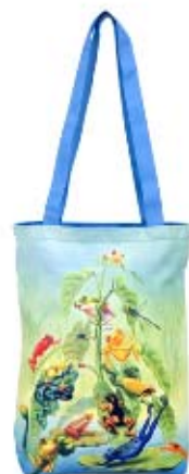
Tote bag "Frog family"