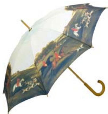
Motiv umbrella "Hunting scene"