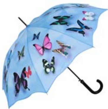
Automatic umbrella "Butterflies" blue