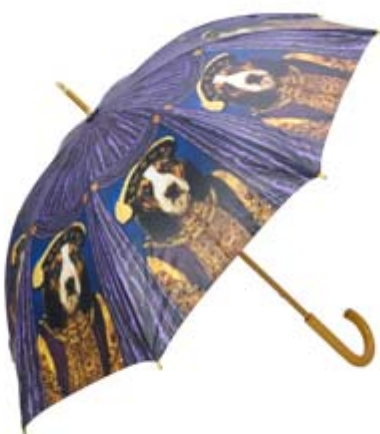
Motiv umbrella "Royal dogs"