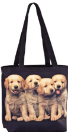
Tote bag "Puppies"