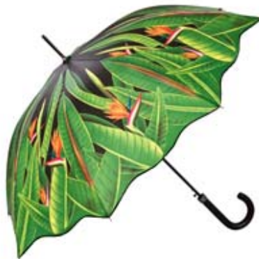
Automatic umbrella "Bird of paradise" green/black