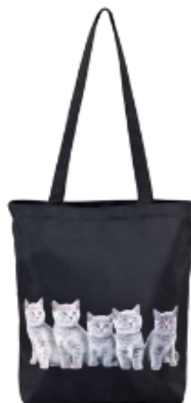
Tote bags "Chartreux kittens"