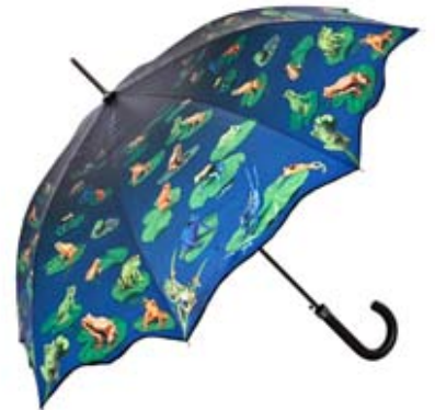
Automatic umbrella "Frog family II"