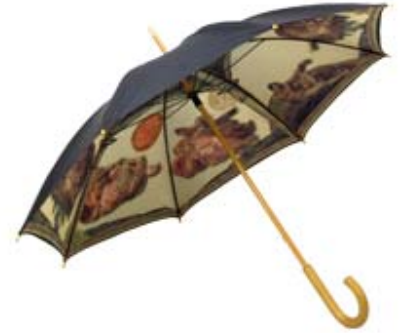
Double layer Michelangelo: "Sistine Chapel"