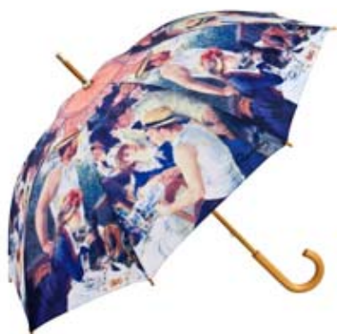
Motiv umbrella Pierre-Auguste Renoir: "Luncheon on the boating party"